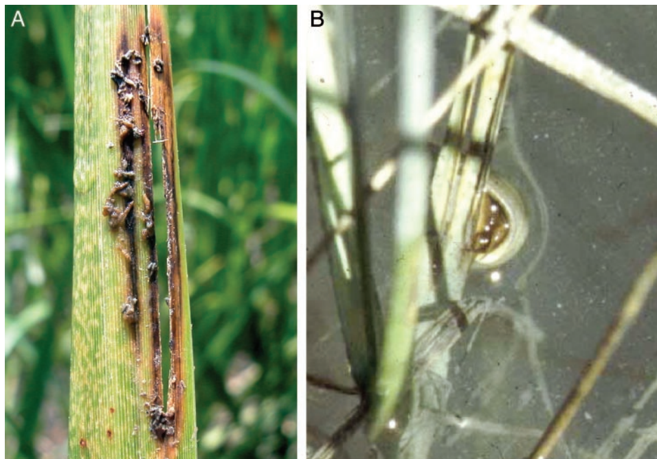
Fig. 1. (A) Snail fecal pellets at high density (>40 pellets; average densities were found to be 22.75 pellets per 10 cm of radulation; see Results ) concentrated on a snail-induced wound on a live Spartina leaf. Note the fungal concentration (dark area) along the radulation edges. A leaf with fecal pellets was collected at night and photographed the next morning. (B) Littoraria on a Spartina leaf grazing a radulation. The majority (>80%) of snail-induced wounds on cordgrass extend through the leaf, as is the case in this picture.

To test the hypothesis that snail deposition of fecal pellets on exposed wounds stimulates fungal growth, we added fecal pellets to artificially induced wounds on green Spartina leaves in a 2-week field experiment. In May 2001, in an intermediate height-form Spartina zone naturally devoid of snails, we applied the following treatments ( n = 6 ) to 1-m 2 , staked areas: simulated snail grazing and simulated snail grazing plus fecal pellets. We simulated natural snail grazing intensity (17–19) by cutting 10-cm